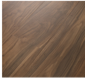
7295 Modern Classic