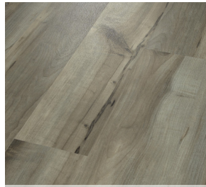
5092 Sea Glass