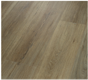
7089 Wild Dunes