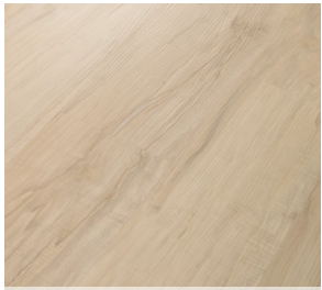
2084 Spalted Maple