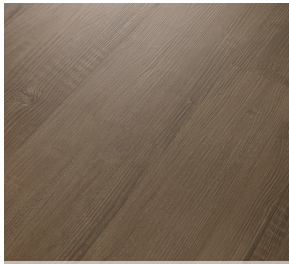
7294 Casual Comfort