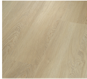
2013 White Sand