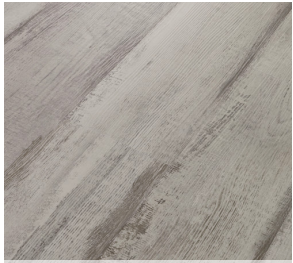
1160 Fresh Driftwood