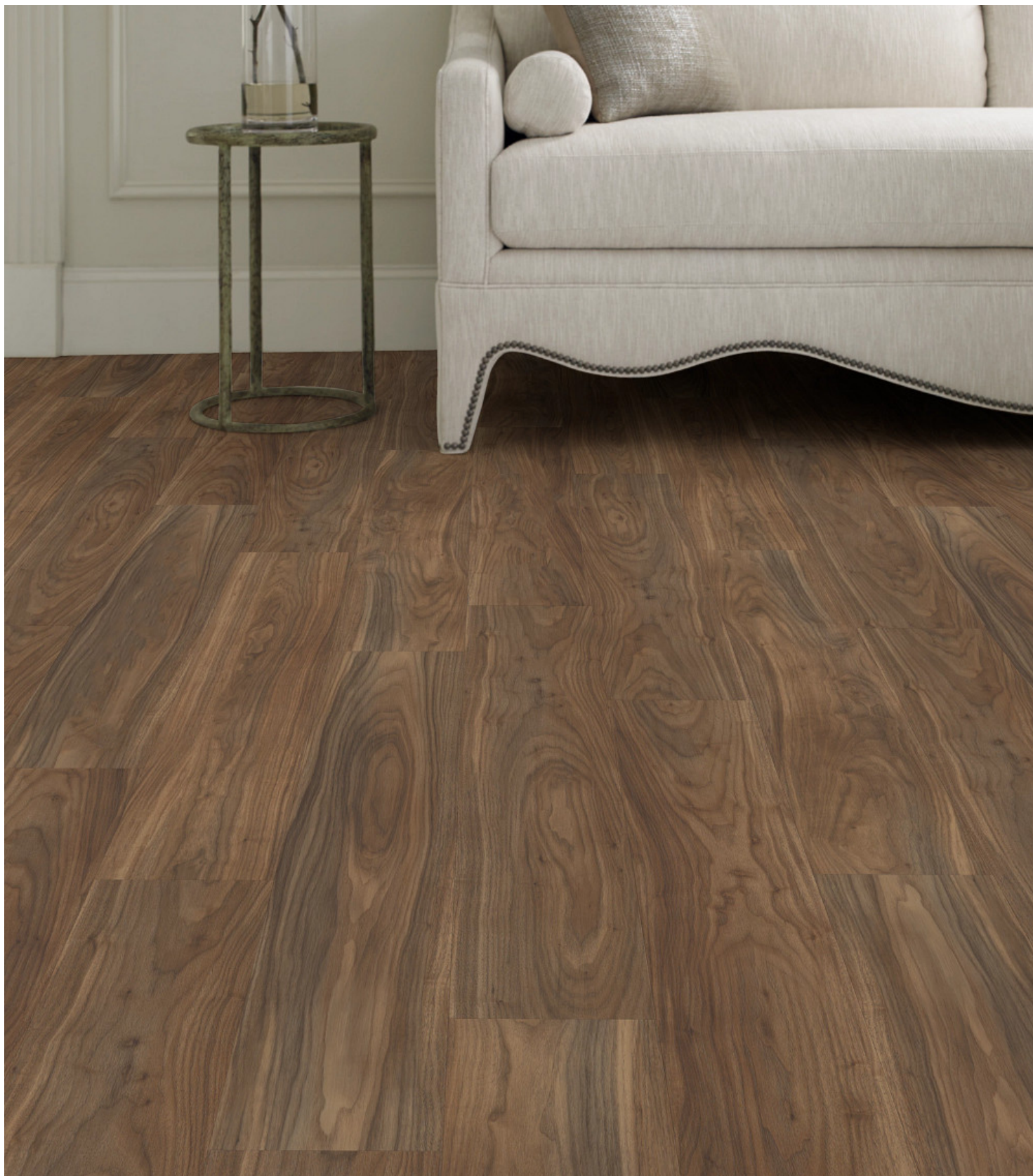
7295 Modern Classic